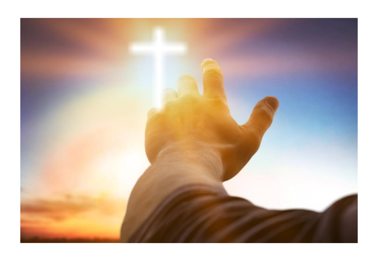
"Honoring Christ in our Hearts and Lives"