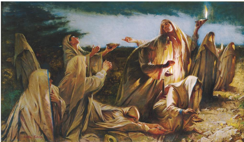
Five of Them Were Wise, by Walter Rane, courtesy Church History Museum

YOU ARE IN GOD'S SANCTUARY. AS YOU ENTER, PLEASE SIT QUIETLY, READ THROUGH YOUR WORSHIP FOLDER, AND PREPARE FOR WORSHIP.