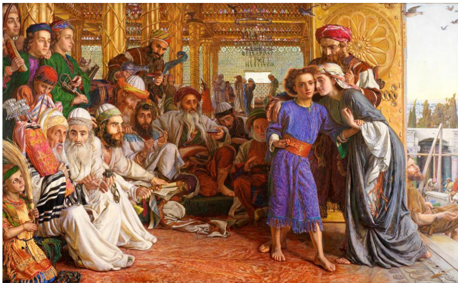
"The Finding of the Saviour in the Temple" (1860) by William Holman Hunt

REMEMBER, YOU ARE IN GOD'S SANCTUARY. AS YOU ENTER HIS SANCTURARY, PLEASE SIT QUIETLY, PRAY, AND READ THROUGH THIS WORSHIP FOLDER TO PREPARE FOR WORSHIP