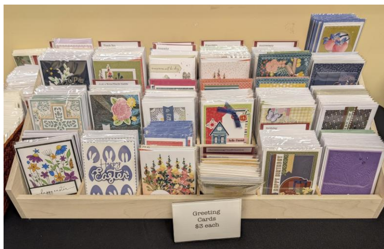
Greeting Cards Available In The Risen Christ Store