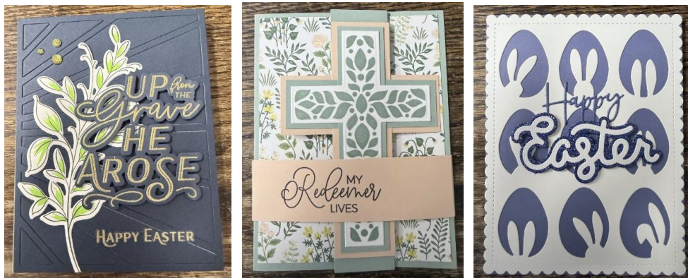
Examples of the cards crafted..