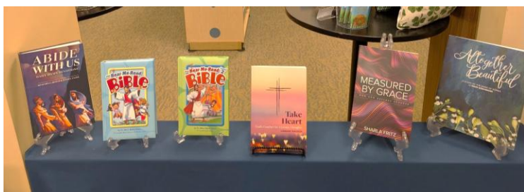
Recent highlights at Gifts of Love Risen Christ Store